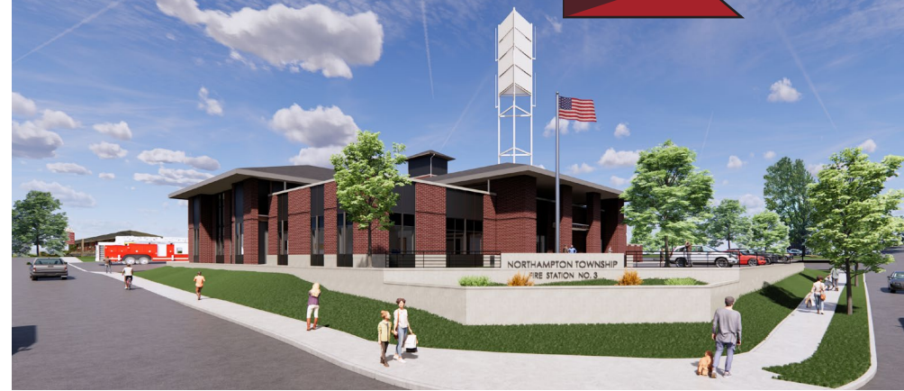
STATION NO. 3