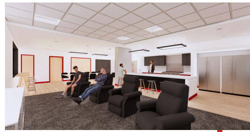
INTERIOR DAY ROOM