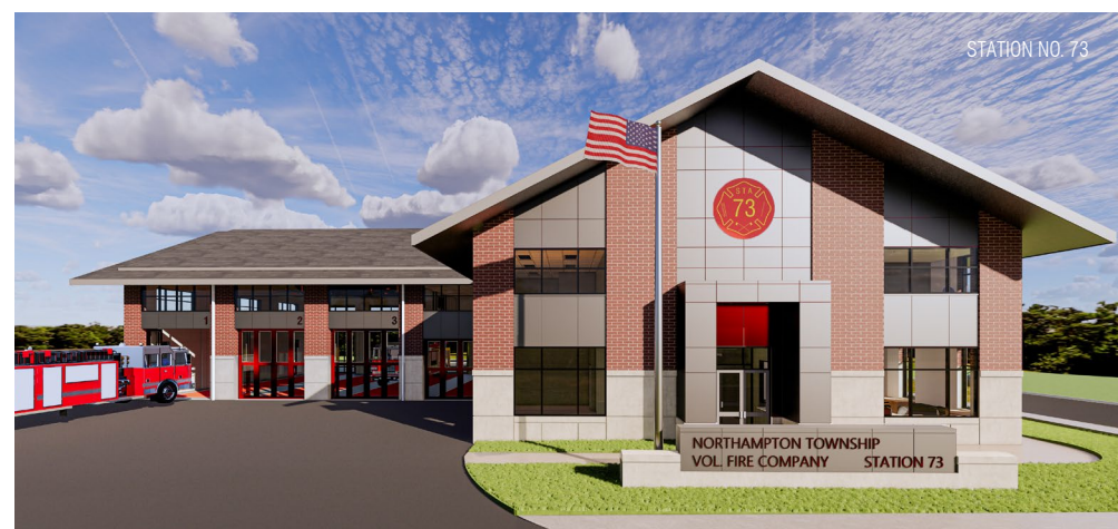
STATION NO. 73

Station 73 - 6:30pm 451 E. Holland Rd, Holland, PA 18966 Station 3 - 7:30pm 3 Township Rd., Richboro, PA 18954