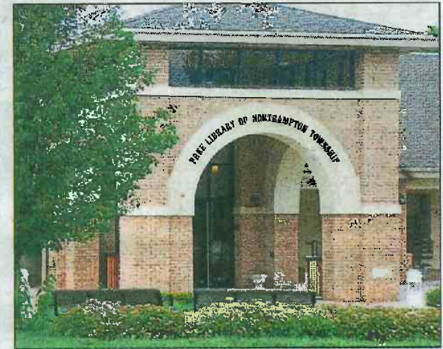
The Free Library of Northampton Township is located at 25 Upper Holland Road, Richboro.

Northampton Township officially became a township on December 14, 1722, covering 26.5 miles. Although the origin of the name of the Township has never been officially verified, it is believed to have